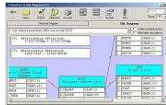
SQL Diagrams for the Open SQL SELECT clauses.