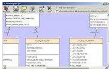
Class Diagrams for Global Classes and Interfaces.