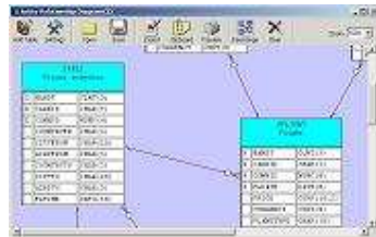
Entity-Relationship Diagrams for the SAP Dictionary.